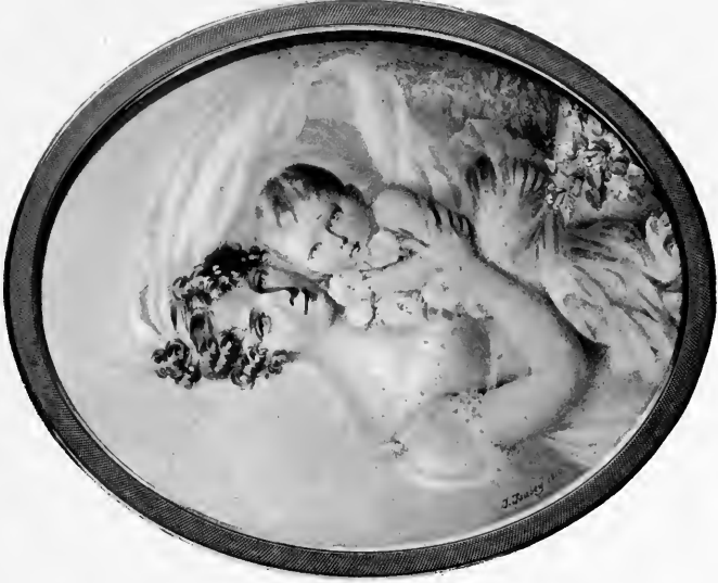
QUEEN HORTENSE AND HER SON, AFTERWARDS NAPOLEON III (1808-1873) BY JEAN BAPTISTE ISABEY

3 3 3 3 3 3 3 3 3 3 3 3 3 3 3 3 3 3 3 3 3 3 3 3 3 3 3 3 3 3 3 3 3 3 3 3 3 3 3 3 3 3 3 3 3 3 3 3 3 3 3 3 3 3 3 3 3 3 3 3 3 3 3 3 3 3 3 3 3 3 3 3 3 3 3 3 3 3 3 3 3 3 3 3 3 3 3 3 3 3 3 3 3 3 3 3